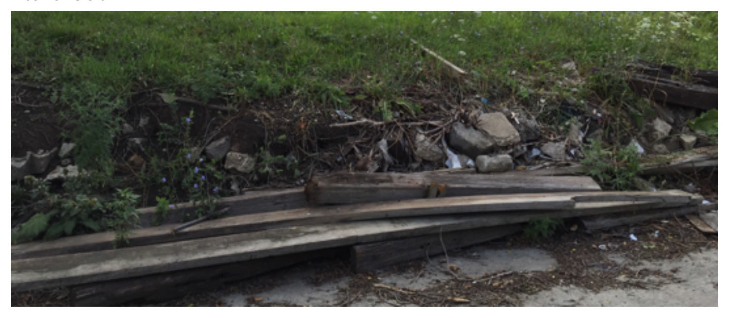
1630 S 3rd (I think. No alley numbers)