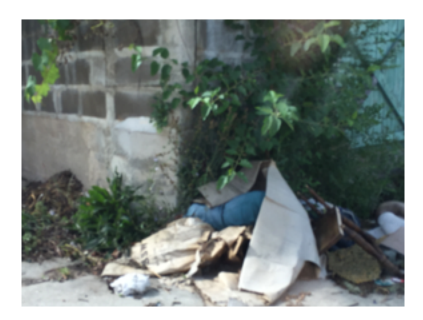
1622 S 3rd (City owned.) Has been in this condition for a decade. It is next door to one of the nicest homes in the area