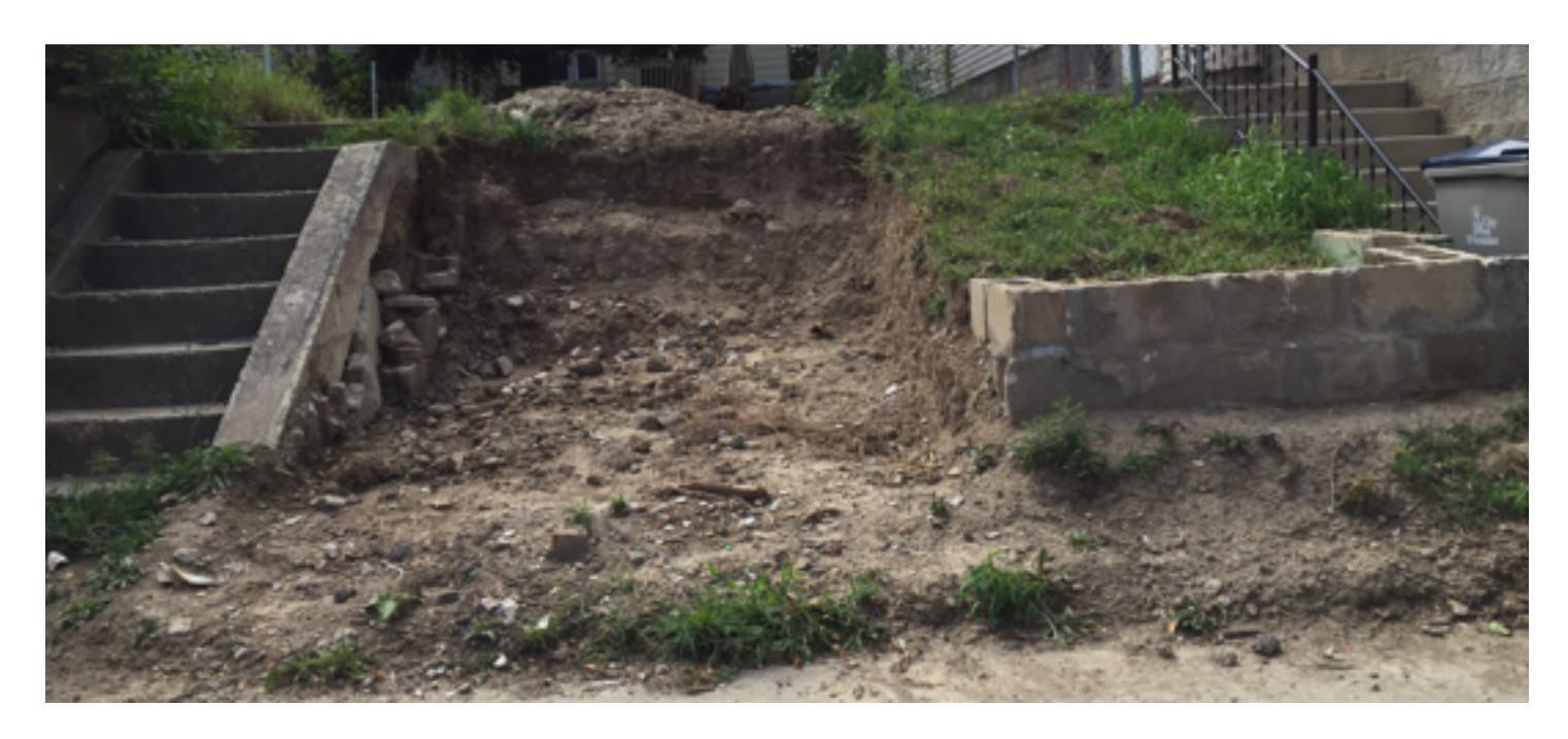
1642 S 3rd (we think, no alley numbers)