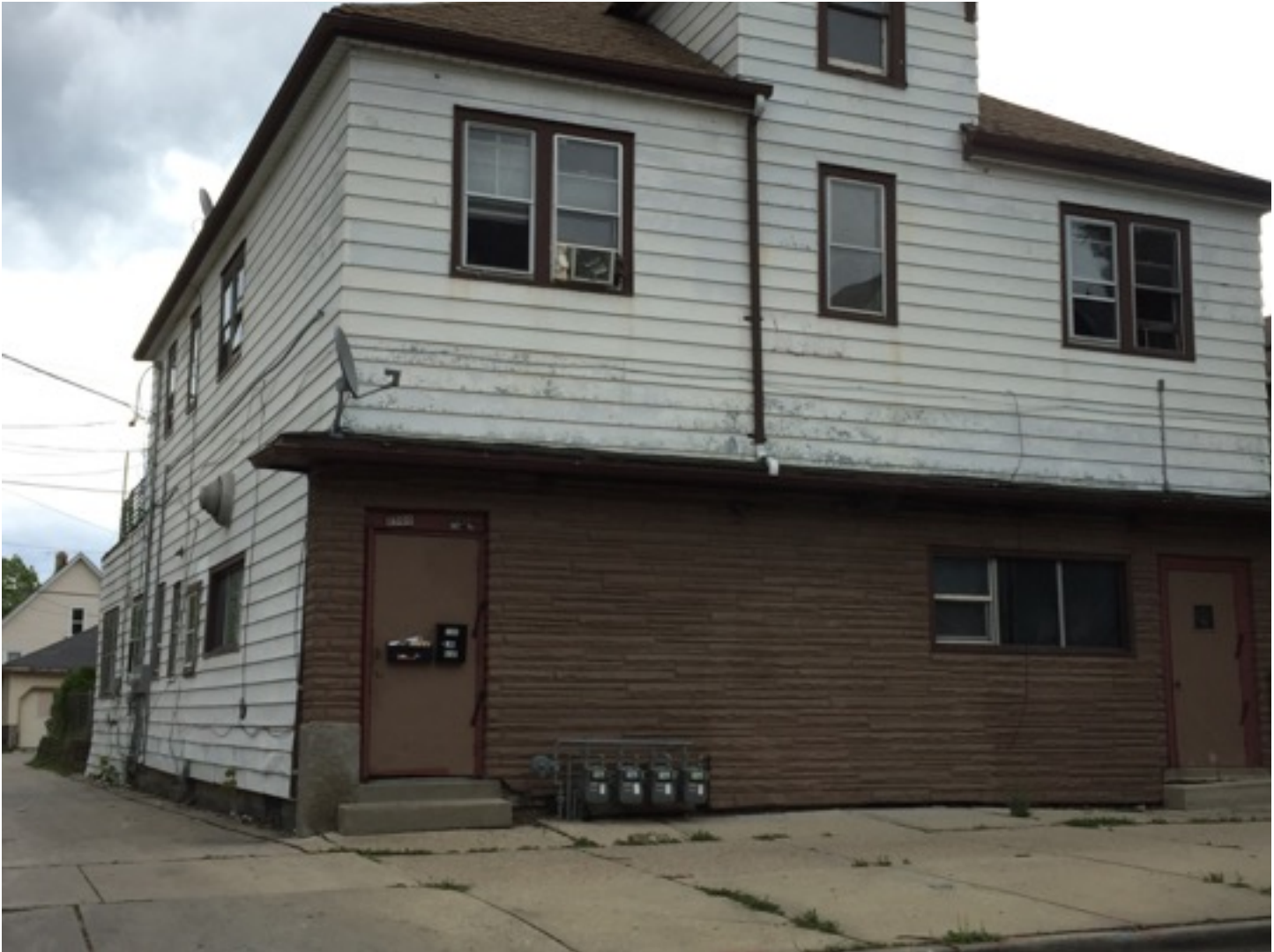
1508 S 10th - Rails /Steps

1500 S 10th - general ugliness. Needs paint etc