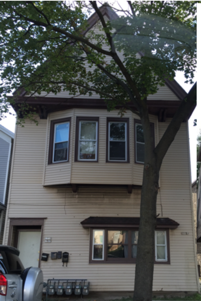
1500 Block South 10th. Our properties at 1558 and 1543 S 10th