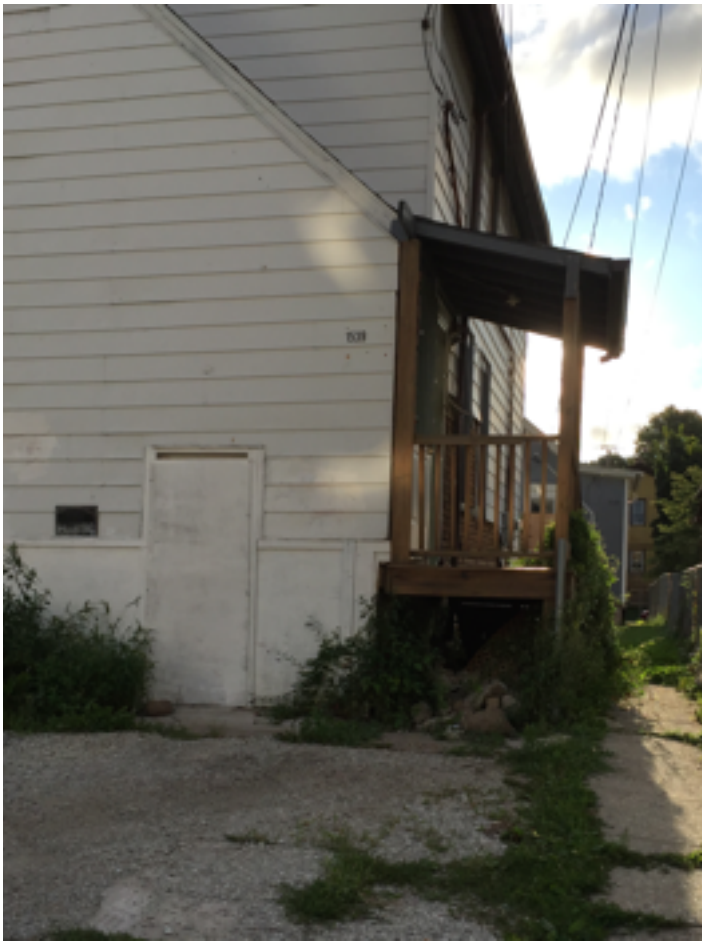
1529 S 10th. Porch roof/Weeds/Ugly