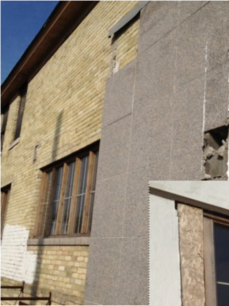
1401 S 6th. Missing panel on south side of building.