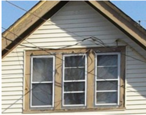
1424 S 6th Adjoining North Missing siding, needs paint, defective front steps needs paint, siding, front step is defective, sidewalk is defective.