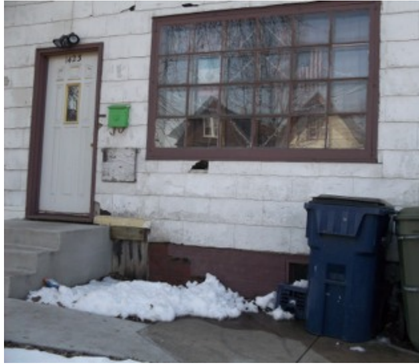
1427 S 6th (Directly across) Needs roofing, siding, rails, porch paint. broken windows, needs paint and you gotta love the anti gravitational porch support