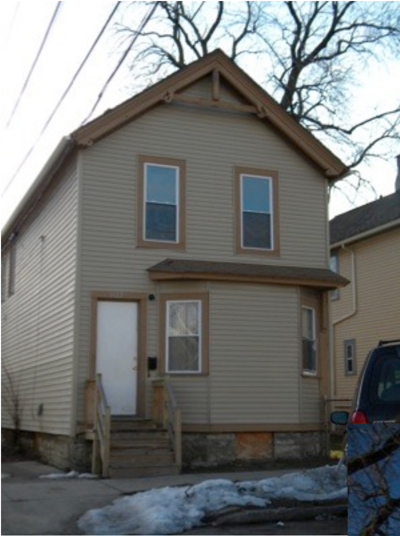
Our property at 1122 S 8th that received a self initiated inspection from Schwartz