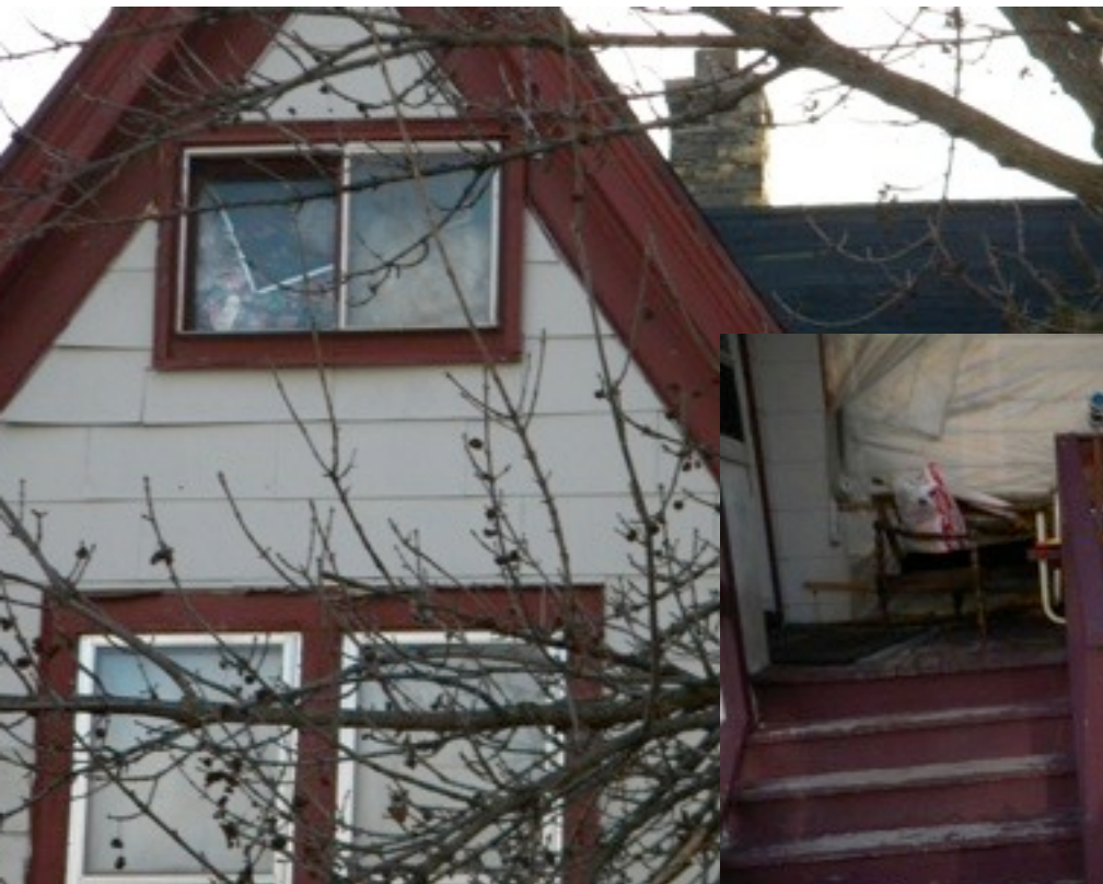
1132 S 8th. Two doors to the north. Many violations, but no SI inspection